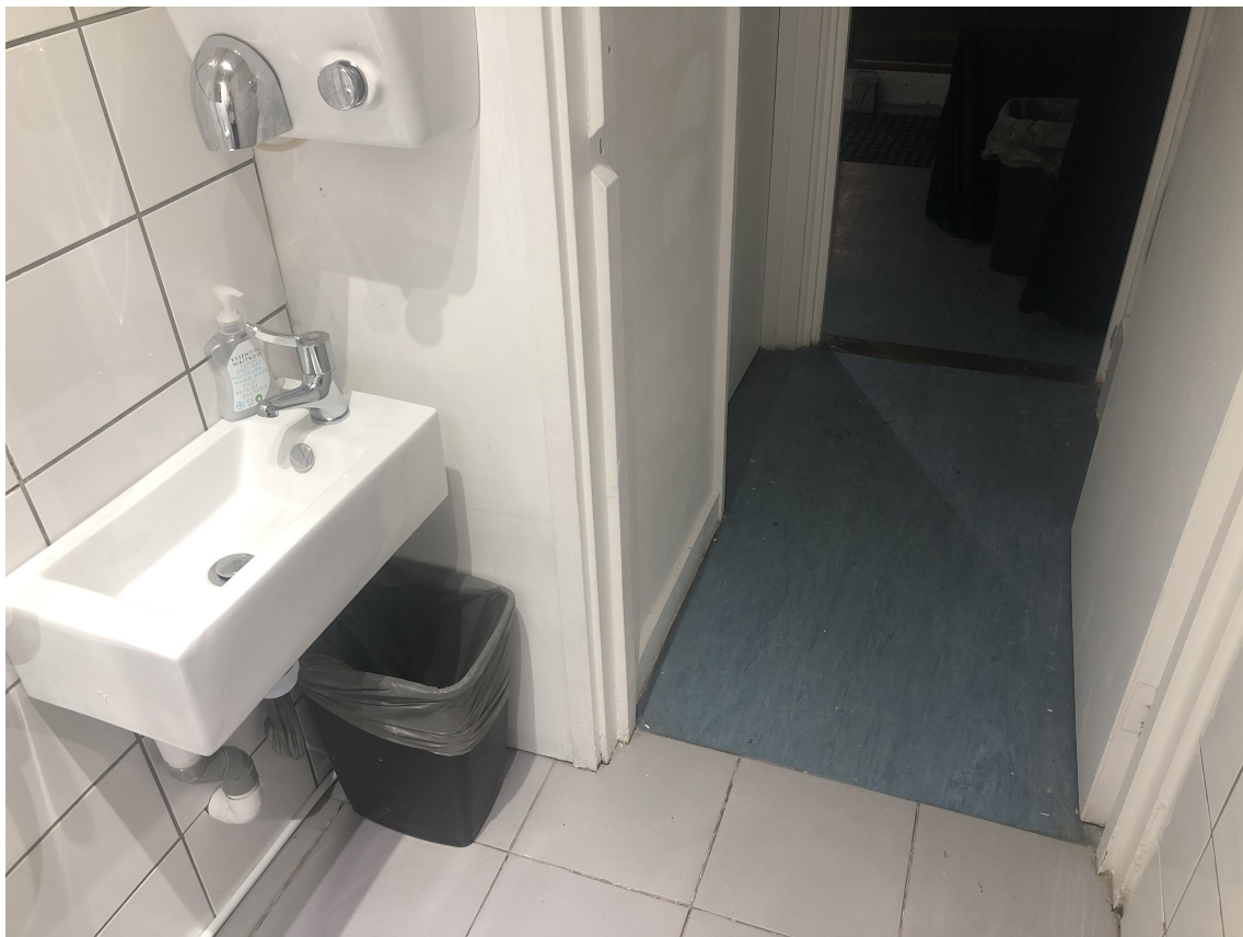
– Bathroom hallway viewed from the bathroom –