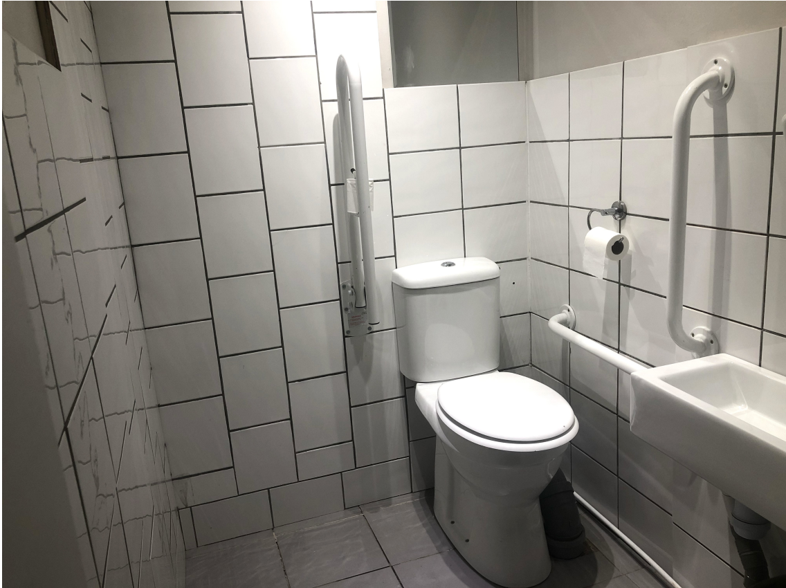
– Bathroom viewed from the bathroom hallway –