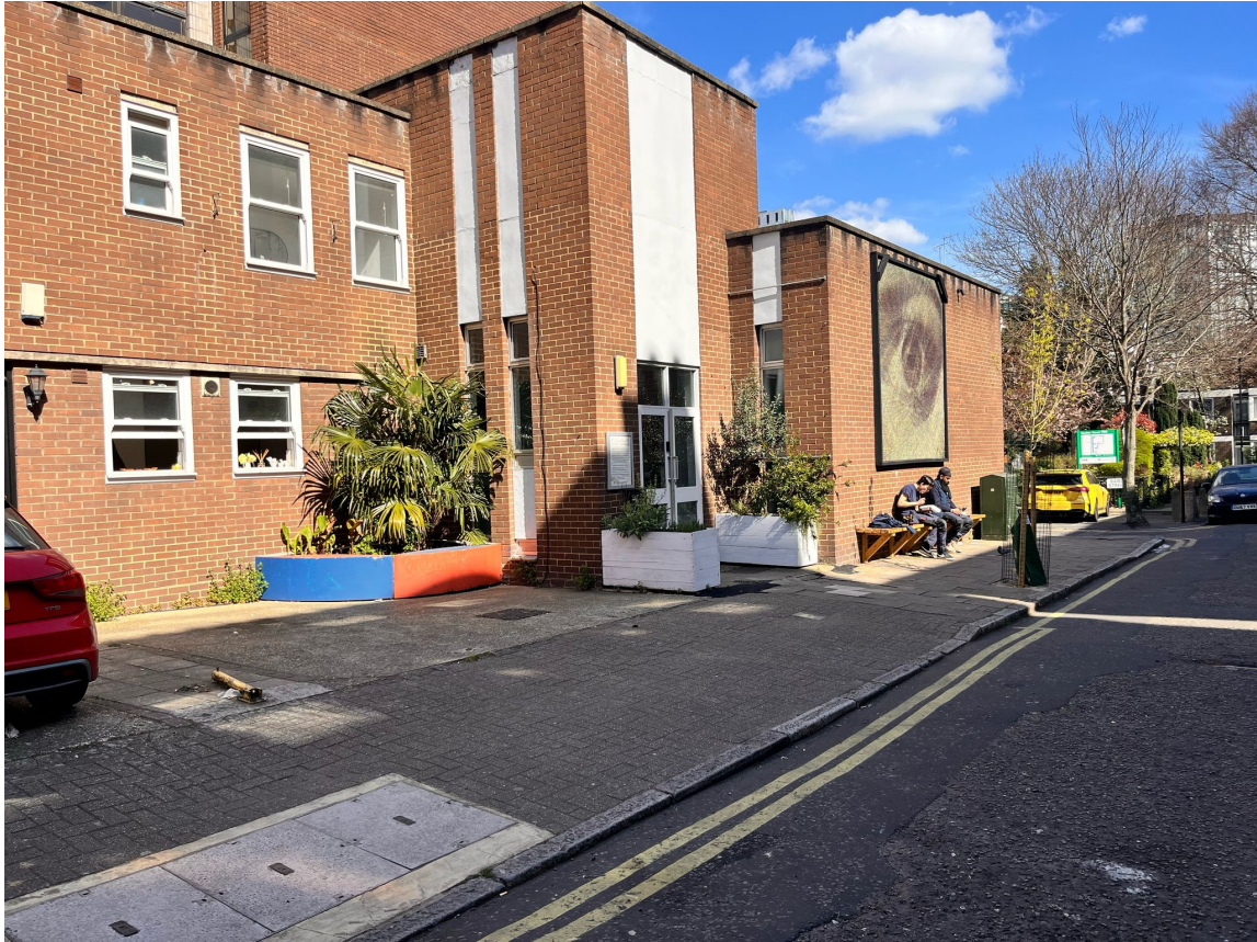
– Kunstraum street view –