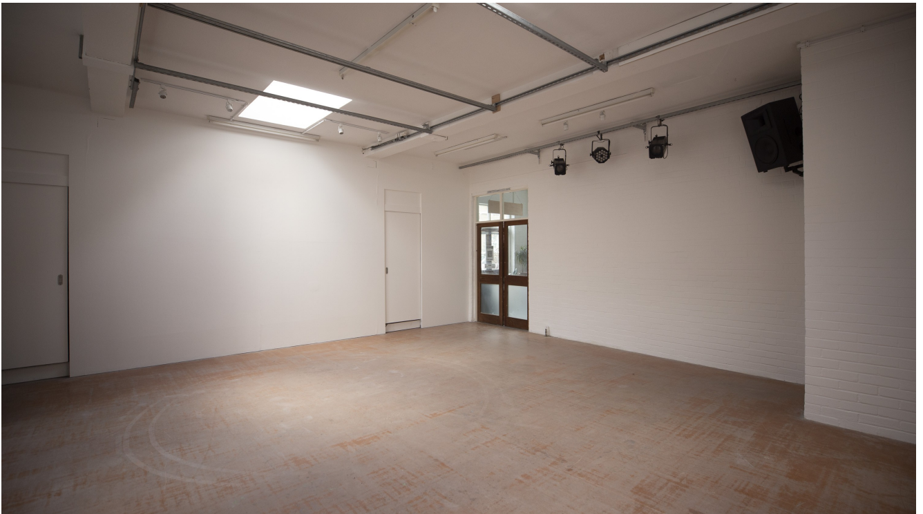
– Main space viewed from the fire exit –