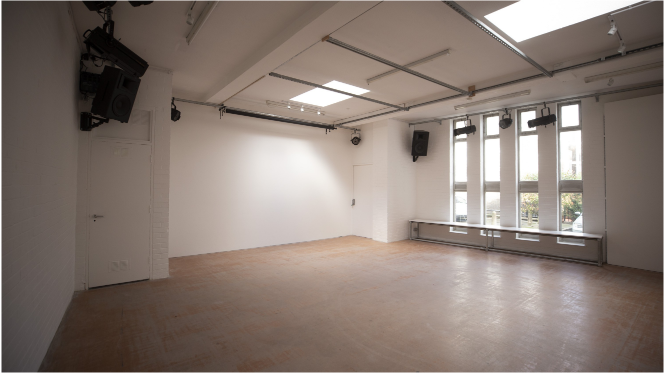
– Main space viewed from the lobby entrance –