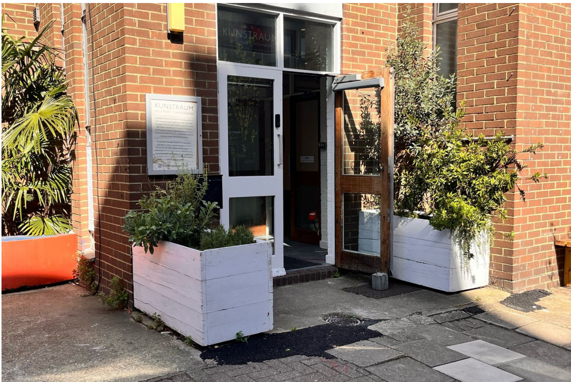
– Kunstraum entrance –